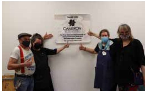
Adult Art Enrichment Class

Our special words of gratitude go to the Cameron Development Corporation for their generous financial contribution – as a Presenting Partner – toward the development and presentation of Harcourt’s Art Enrichment Program in the two upcoming years.