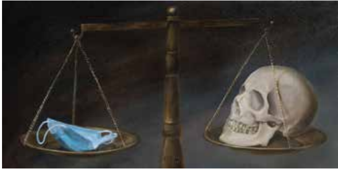
PandemARTium: 33rd Annual Members' Show + Art Sale