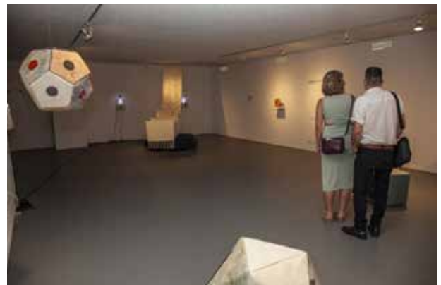
Kelly Ruth opening July 30, 2021.