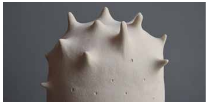
The Art Incubator Gallery Ruta Nichol: Beyond Minimalism: The Ceramic Art of Ruta Nichol (artist from Edmonton, AB)

Exhibition Press: https://preview-art.com/highlight/sara-norquay-citizen-of-the-world/