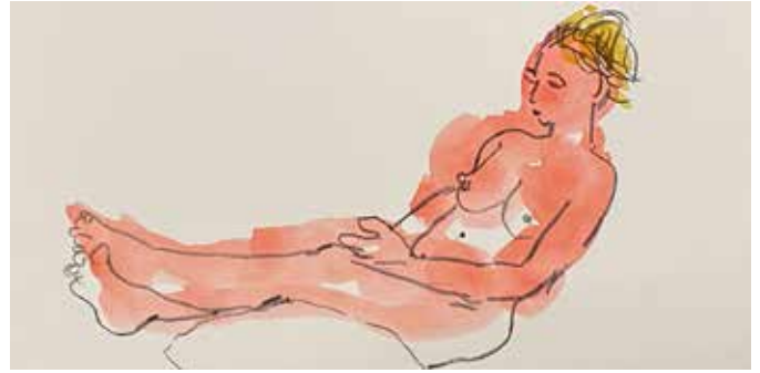
EmBODY + EmBRACE: Annual Naked Show + Art Sale