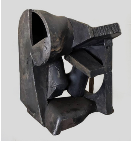
Peter Hide (RCA) – Sculpture & Architecture, 2014, mild steel.

Abstract sculpture is a structure that is not useful, like a table or a chair. It doesn't have a subject matter, such as a landscape or a portrait. It is not literal. However, this doesn't mean it lacks content, that the work lacks delicacy, or power, or beauty.